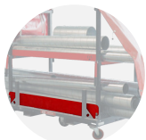
Side kit DR-SK