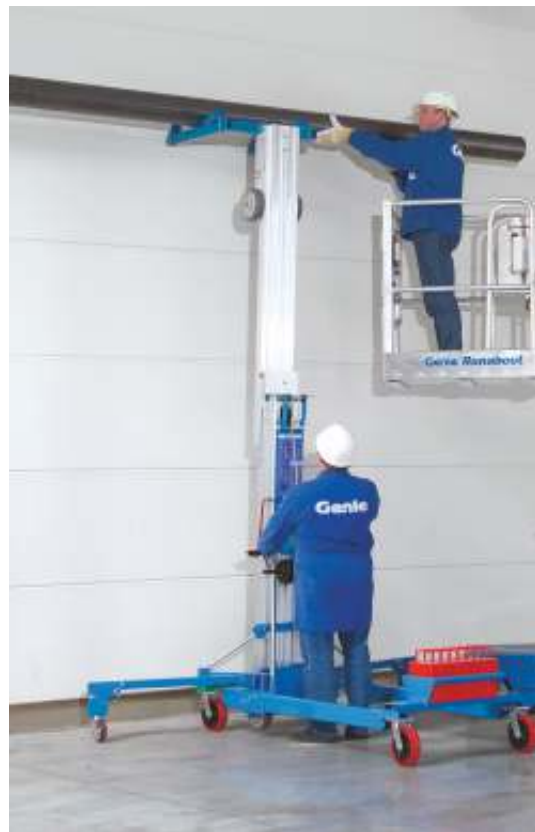
Assemblies at walls easily made with the Wienold SLK