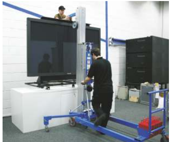
Lifting and positioning heavy and large loads absolute safely and easily