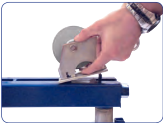
2. Slide forward and remove