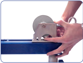
1. Lift quick release tab