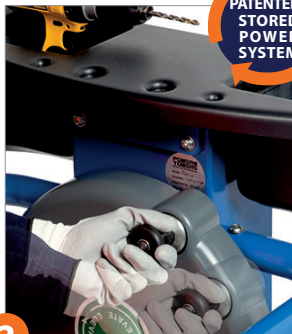
2 Simply turn the handle...