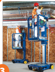
3 ...3.5m working height in 11 seconds.