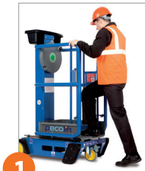
1 Step in.