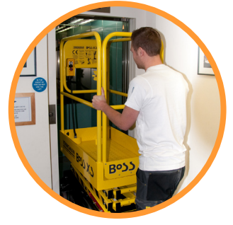
Fits through standard doorways and into passenger lifts