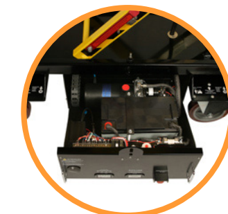
Servicable components housed in a slide out compartment