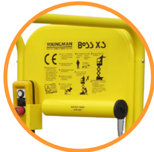
Safety and usage instructions mounted on guardrail