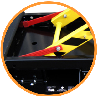
Fail-safe props for deployment during maintenance