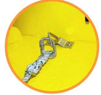
Slip-resistant deck incorporates lanyard point

The BoSS X-Series is the tough, professional, manually propelled range of micro powered access platforms from BoSS; one of the world leading suppliers of innovative work at height solutions. Designed for a multitude of tasks including general maintenance, cleaning, painting, and fit and strip out work they can be used on construction projects, in factories, transport environments, shopping centres, retail outlets and in offices and offer numerous features and benefits: