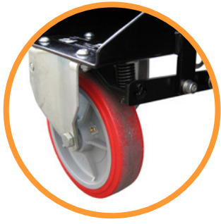
Auto braking on fixed castors