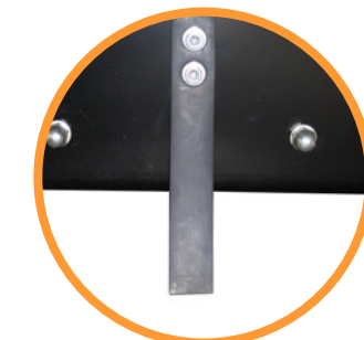
Anti-static earthing strip