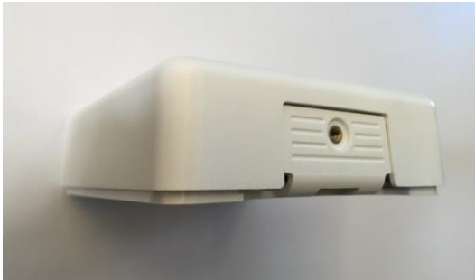
Figure 4: Properly closed Beacon is NOT flush

DO NOT apply excessive pressure while closing the Beacon or after it has been installed as doing so can damage the Beacon