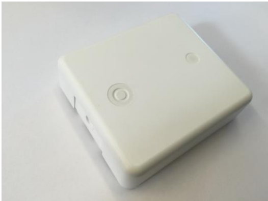
Figure 3: Top housing installed