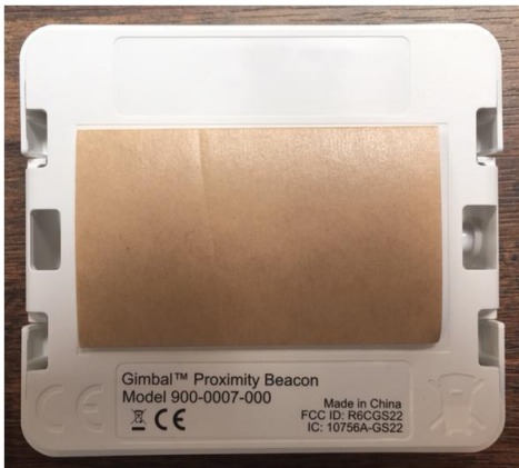
Figure 1: Bottom housing with double-sided tape applied