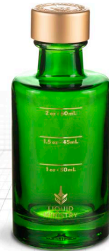
COLOR: Emerald Green | CAP COLOR: Gloss Gold