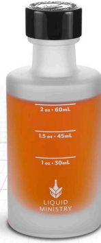
COLOR: Frosted Glass | CAP COLOR: Gloss Black