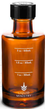
COLOR: Vintage Amber | CAP COLOR: Gloss Black

Because of size limitation, logo with small details may not be suitable for etching. Only logos that can be converted to a clearly-defined black and white color scheme can be etched effectively. For the best results, choose a version of your logo with the least amount of details. Logo setup may be subject to initial design fees.