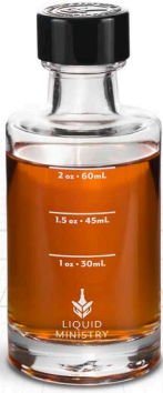
COLOR: Clear Glass | CAP COLOR: Gloss Black