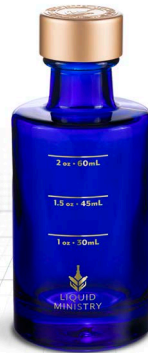
COLOR: Deep Blue | CAP COLOR: Gloss Gold