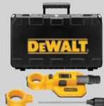
DWH050K LARGE HAMMER DUST EXTRACTION - HOLE CLEANING