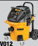
DWV012 10-GALLON HEPA/RRP WET/DRY DUST EXTRACTOR

*For 20V MAX* Maximum initial battery voltage (measured without a workload) is 20 volts. Nominal voltage is 18. **Maximum initial battery voltage (measured without a workload) is 20 and 60 volts. Nominal voltage is 18 and 54.