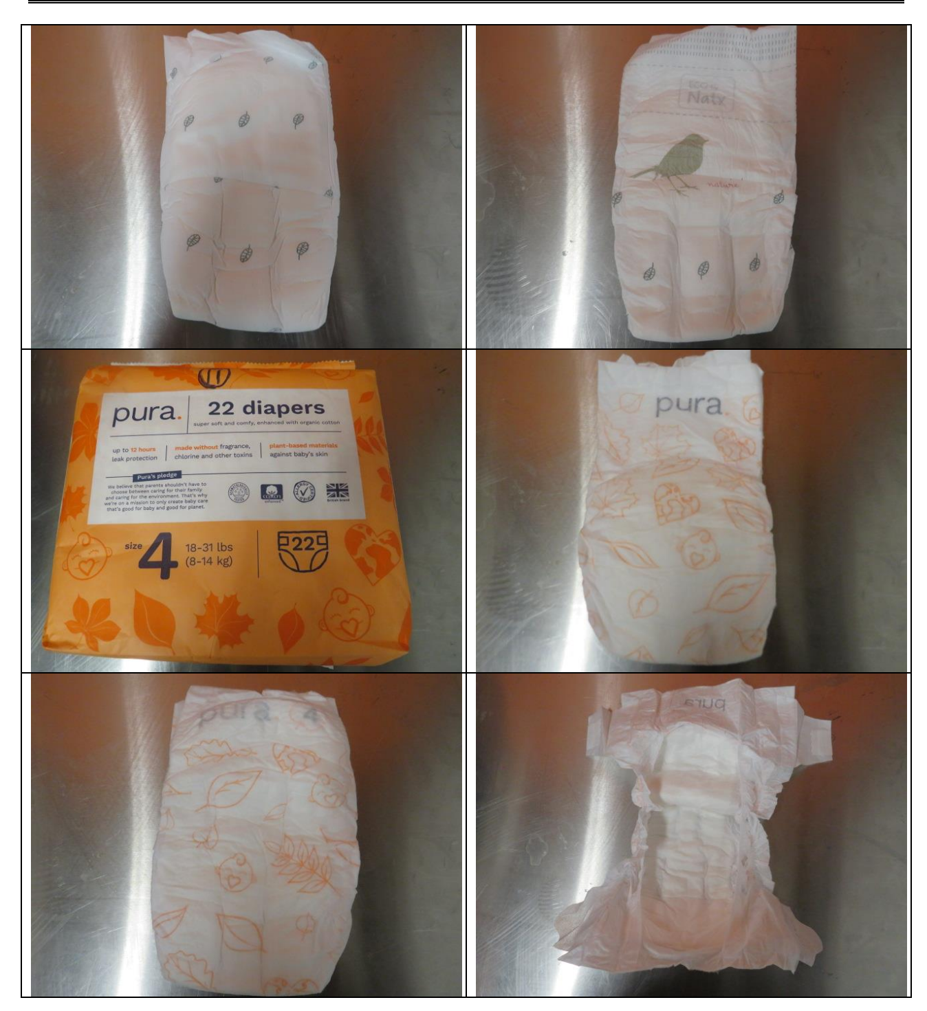
Revised Date: December 13, 2023 Date: December 6, 2023 Page 10 of 19

"This document is issued by the Company subject to its General Conditions of Service printed overleaf, available on request or accessible at <a href="http://www.sgs.com/en/Terms-and-Conditions.aspx">http://www.sgs.com/en/Terms-and-Conditions.aspx</a> and, for electronic format documents, subject to Terms and Conditions for Electronic Documents at <a href="http://www.sgs.com/terms-e-document.htm">www.sgs.com/terms-e-document.htm</a>. Attention is drawn to the limitation of liability, indemnification and jurisdiction issues defined therein. Any holder of this document is advised that information contained hereon reflects the Company's findings at the time of its intervention only and within the limits of Client's instructions, if any. The Company's sole responsibility is to its Client and this document does not exonerate parties to a transaction form exercising all their rights and obligations under the transaction documents. This document cannot be reproduced except in full, without prior written approval of the Company. Any unauthorized alteration, forgery or falsification of the content or appearance of this document is unlawful and offenders may be prosecuted to the fullest extent of the law. Unless otherwise stated the results shown in this test report refer only to the sample(s) tested and such sample(s) are retained for 90 days only."