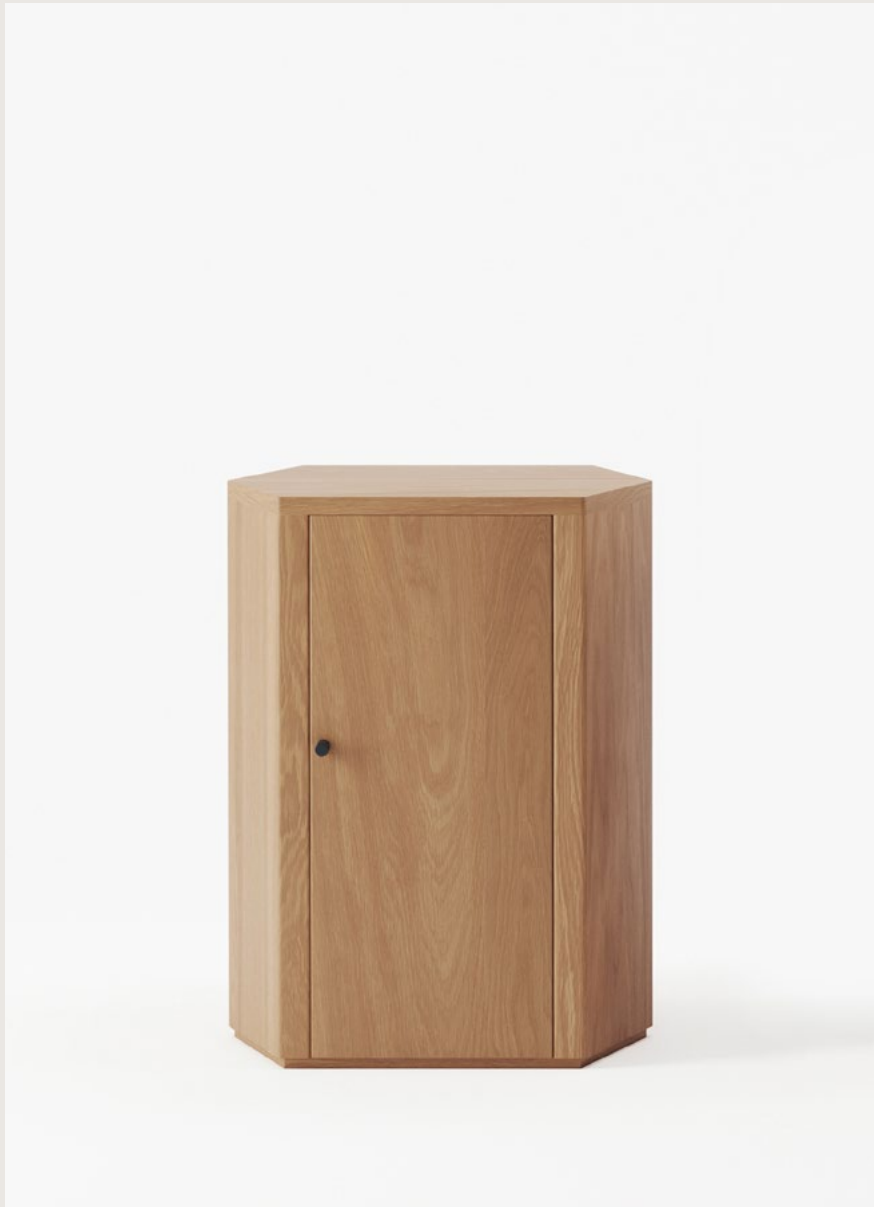
Park Nightstand by Yaniv Chen Tear Sheet