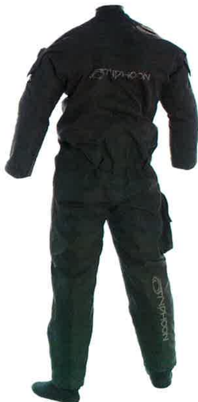
Back Entry Trilaminare Diving Drysuit