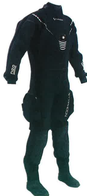
Back Entry Neoprene Diving Drysuit