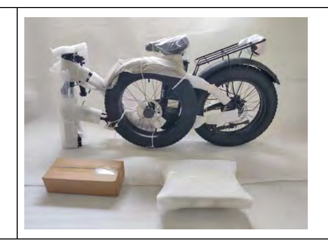
The Packaging of the e-bike