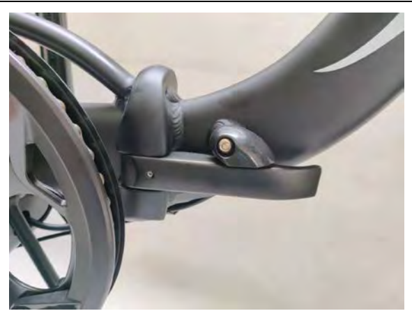
The safety switch and the frame folding quick release lever