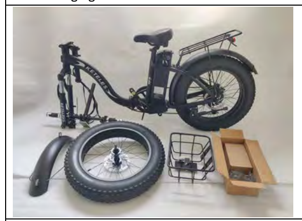
Only need to install front wheel, handlebar, pedals, fender, basket