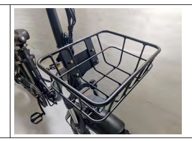
Install the basket