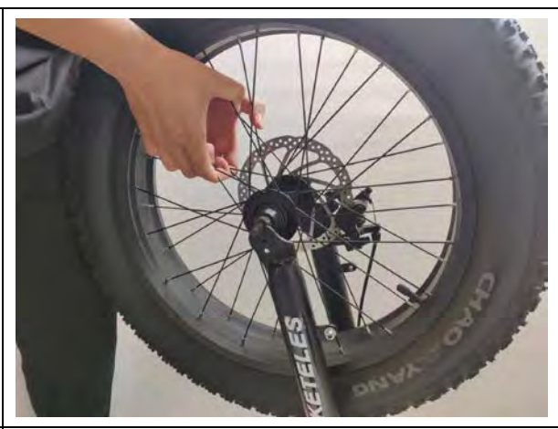
Put the front wheel on the fork