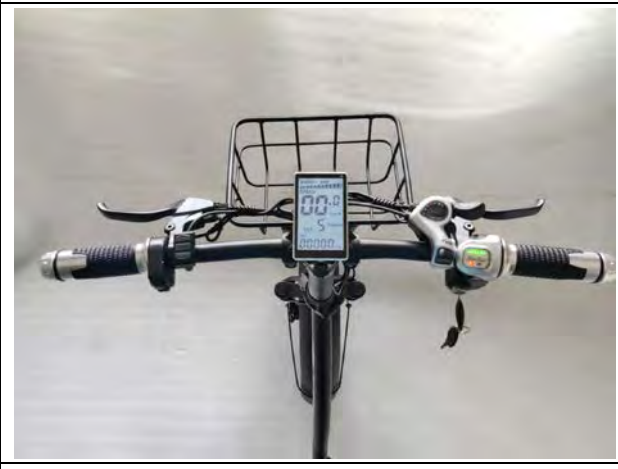
Turn the key on the right and then press button M for 3~4 seconds on the left