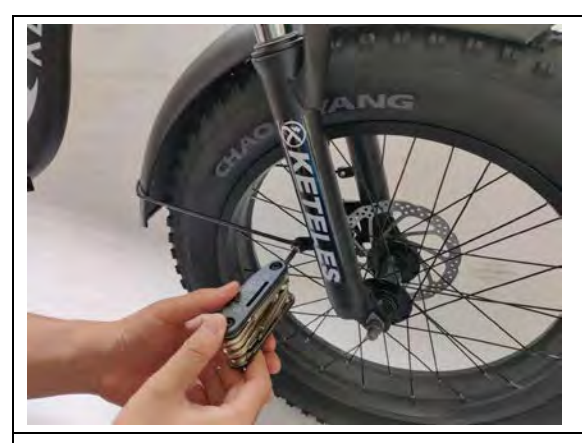
Tighten another 2 bolts to fix front fender