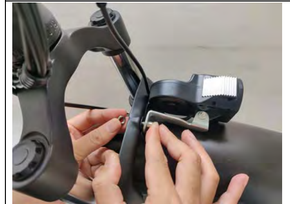
Use the bolt to join the headlight, fork arch and fender