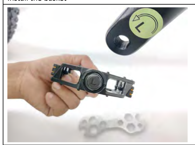
The pedal with letter L should be fixed on the left side