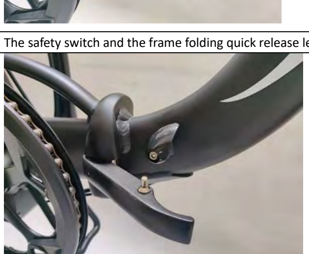
Pull the frame folding quick release lever outward