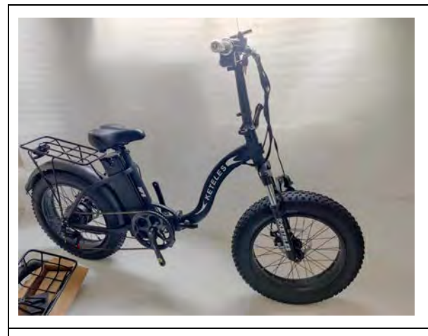
Stand the steering column