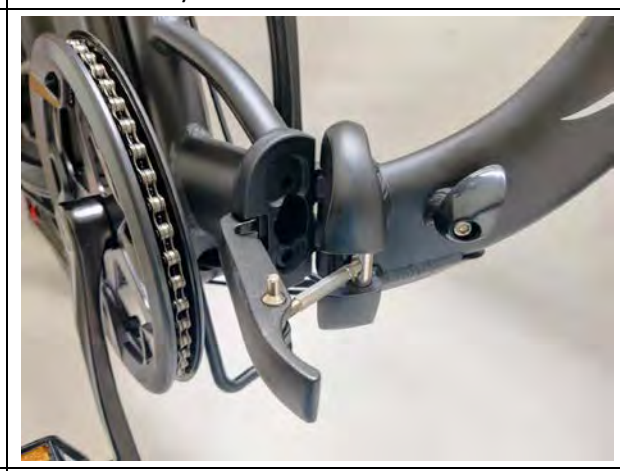
Fold the frame