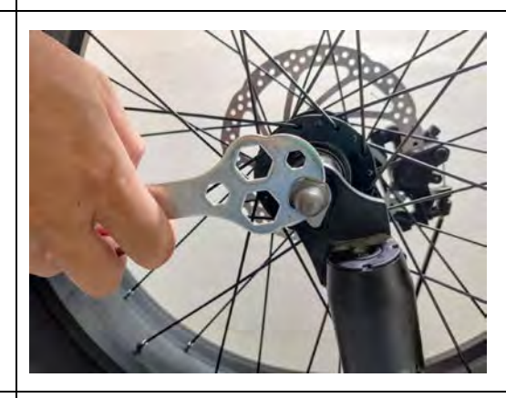
Tighten the nuts on both sides