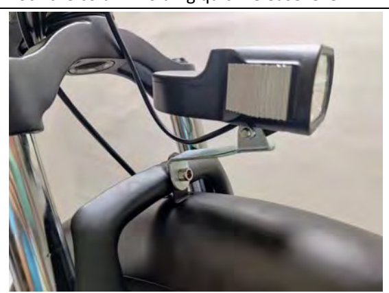
Tight the bolts