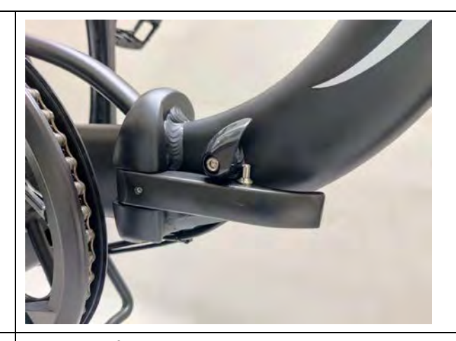
Turn the safety switch