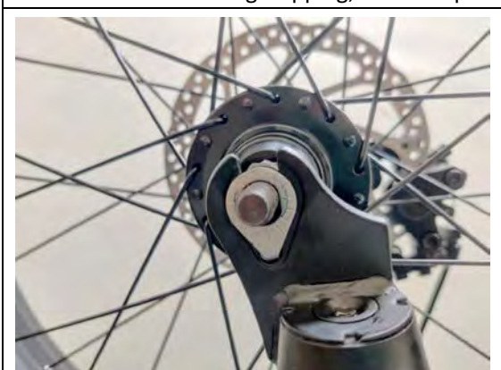
The fork dropouts hold the tips of the front hub