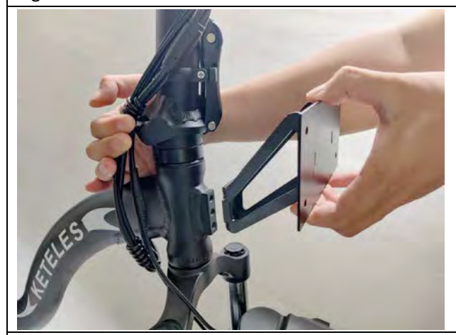
Fix the basket holder to the head tube