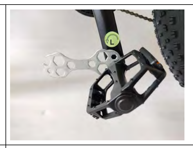
Turn spanner counter-clockwise to fix the pedal L