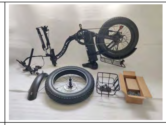
Turn upside down