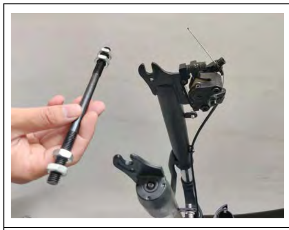
Remove the fork spacer. (it protects the fork from crushing and deformation during shipping, it's not a part of the bike )