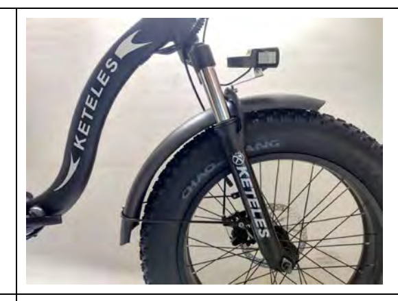
The headlight and front fender are fixed to the fork