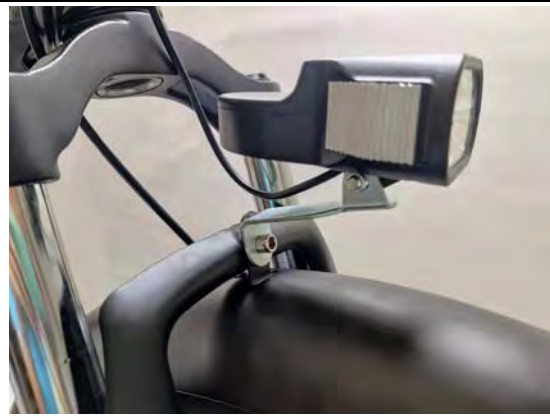
Tight the bolts