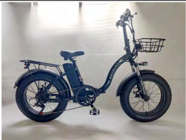
Side view of the e-bike