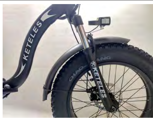
The headlight and front fender are fixed to the fork