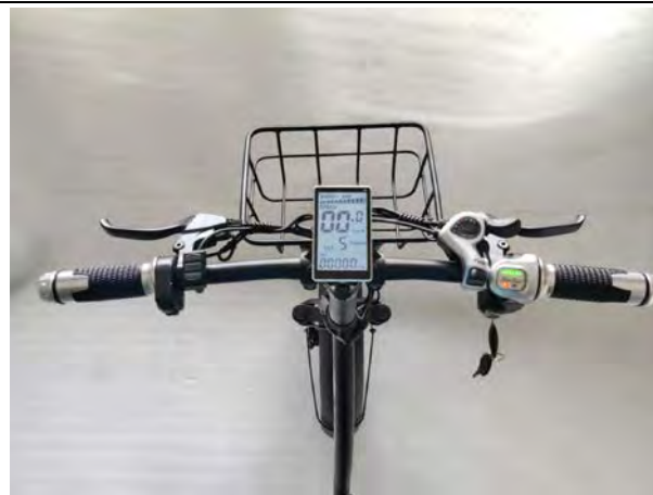
Turn the key on the right and then press button M for 3~4 seconds on the left