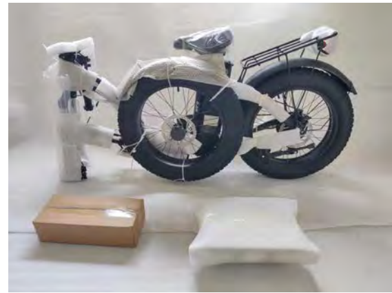
The Packaging of the e-bike