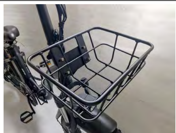
Install the basket