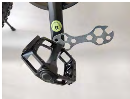
Turn the spanner clockwise to fix the pedal R