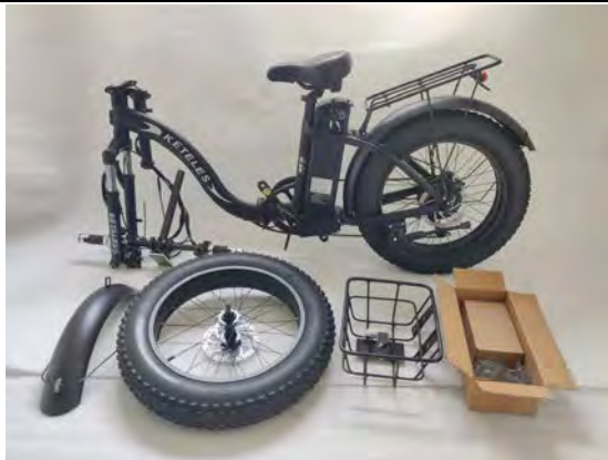
Only need to install front wheel, handlebar, pedals, fender, basket