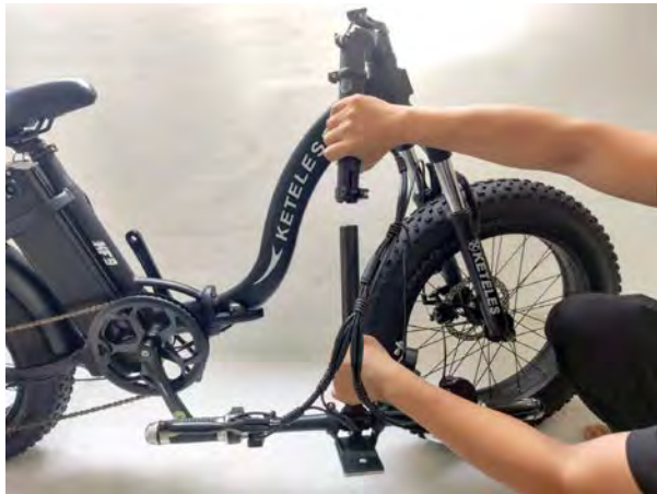
Ready to install the steering column