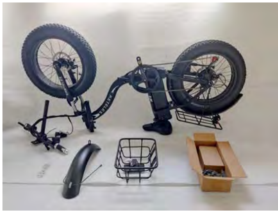
Front wheel installation completed