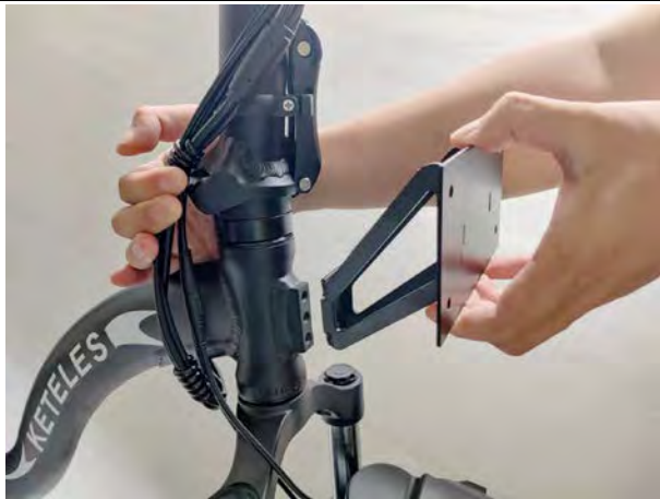
Fix the basket holder to the head tube