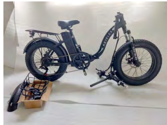
Turn it over again