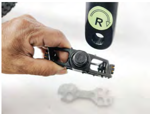
The pedal with letter R should be fixed on the right side