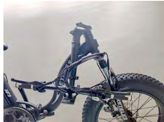
Insert the upper part of the column into the lower part