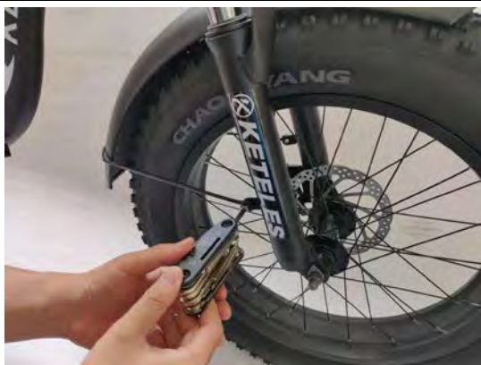
Tighten another 2 bolts to fix front fender