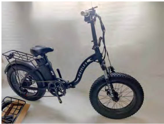
Stand the steering column