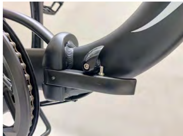
The safety switch and the frame folding quick release lever