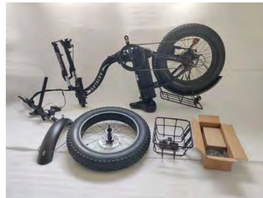
Turn upside down