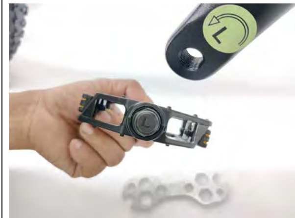
The pedal with letter L should be fixed on the left side