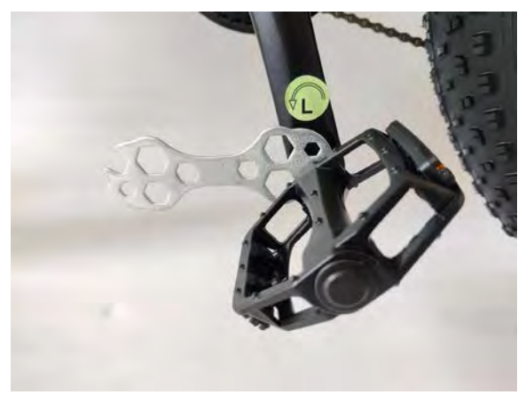
Turn spanner counter-clockwise to fix the pedal L