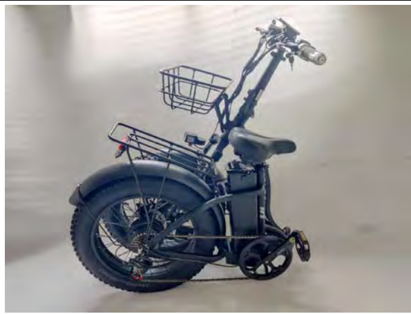
Fold the e-bike