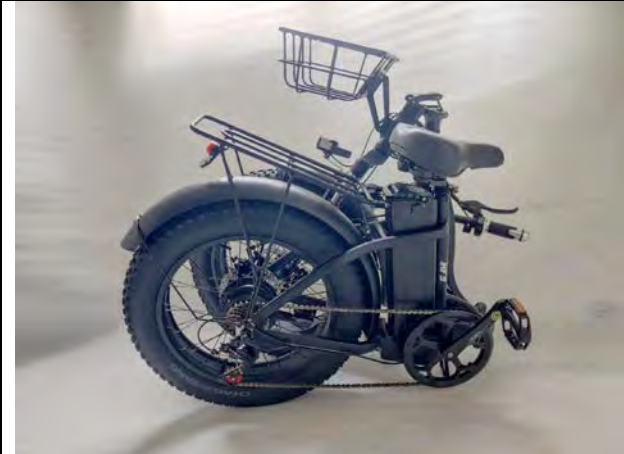
Fold the steering column

Tips: Full Electric Mode (i.e. using throttle only) is for flat roads.