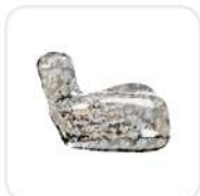
Silver leaves - J25