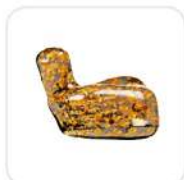
Gold leaves - J26