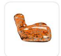
Brass leaves - J24