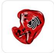
Transparent red - J2