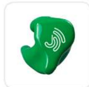
Solid green - J15