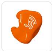
Solid orange - J13