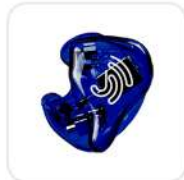
Transparent navy - J9