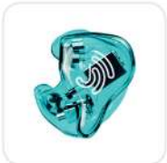
Transparent cyan - J7