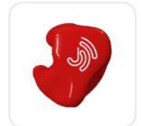
Solid red - J12