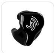
Black - J19