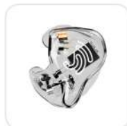
Transparent - J22