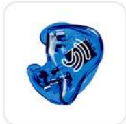
Transparent blue - J8