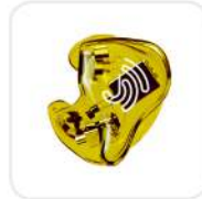
Transparent yellow - J4