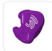
Solid purple - J17