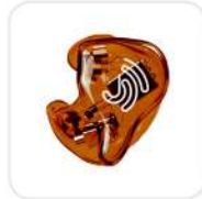
Transparent orange - J3