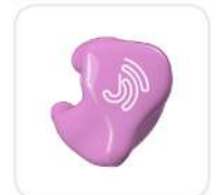
Solid blush - J18