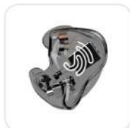
Smoke - J21