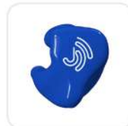
Solid blue - J16