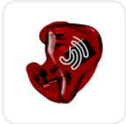
Transparent wine - J1

The JRUMZ XP05 Custom HiFi 10 Driver Full Shell Acrylic In-Ear Monitors are high-quality, custom-made earphones that are specifically designed for musicians and music enthusiasts. These monitors are crafted with precision and care, using top-of-the-line materials and cutting-edge technology to ensure that they deliver outstanding sound quality and a comfortable, secure fit. With their full-shell acrylic design, they provide excellent noise isolation and offer a personalized listening experience that is tailored to the unique needs of each individual user. Whether you're a professional musician or simply someone who loves to listen to music on the go, the JRUMZ XP05 monitors are an excellent choice.