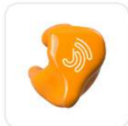
Solid yellow - J14