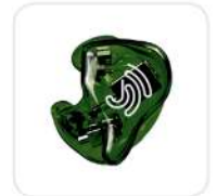
Transparent emerald - J6