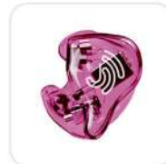
Transparent pink - J11