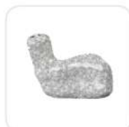
Silver glitter - J27