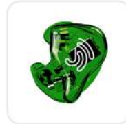
Transparent green - J5