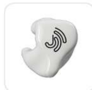
White - J23