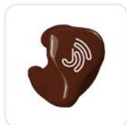
Solid brown - J20