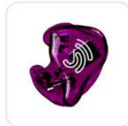
Transparent purple - J10