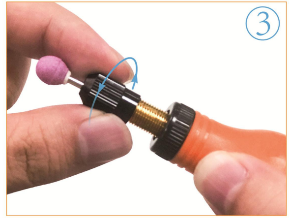
3. Insert the bits you need, hold the lock 4. Do not press the spindle lock button and screw on the nut tightly