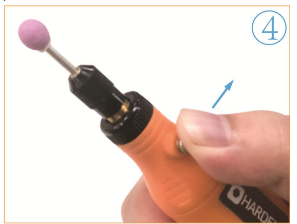
button when the motor is running.