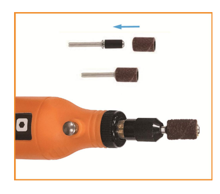
The shaft size of the attachment must be matched to the collet. ATTENTION: Mismatch will vibrate and cause loss of control.