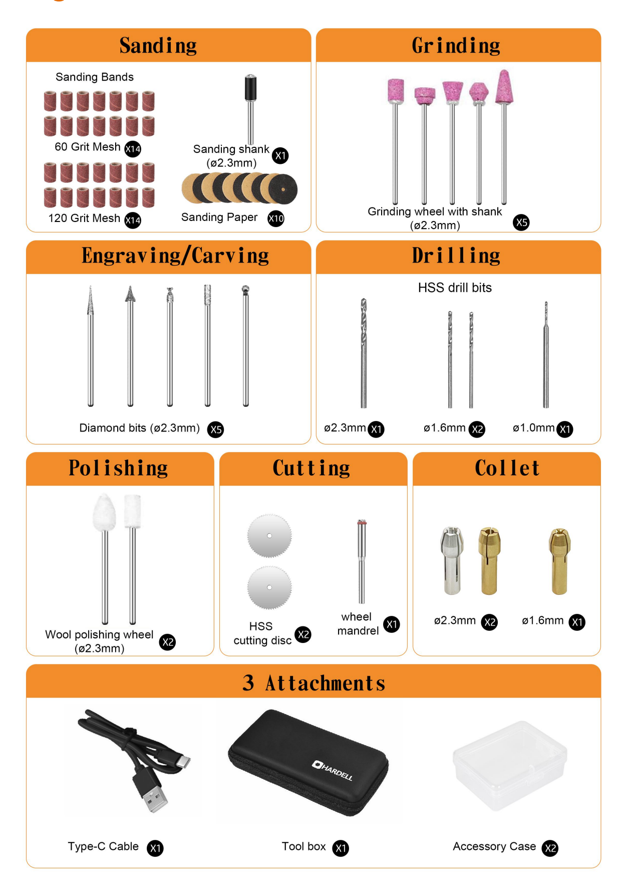
NOTE: The product contains a total of 3 collets, Size: φ1.6mm/φ2.3mm Usually, there is already a 2.3 mm collet on the rotary tool