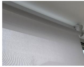
Rolling control chain to put sunscreen blinds down