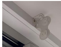
Measure the blinds width, fit Idle end bracket on the other side.