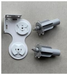
Idle End Double Bracket with