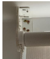
Insert clutch side into lower clutch bracket (sunscreen blinds)