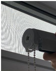
Insert clutch side into upper clutch bracket ( blackout blinds )