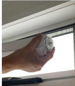
Insert idle end plug into upper idle end bracket ( blackout blinds )