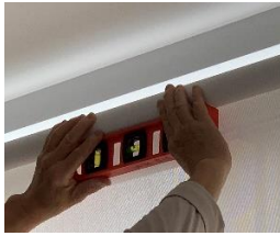
Using spirit level to check if the blinds fitted on the same level