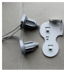
Clutch Double Bracket with