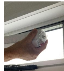
Insert idle end plug into lower idle end bracket (sunscreen blinds)