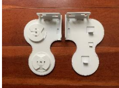
Left hand clutch double bracket