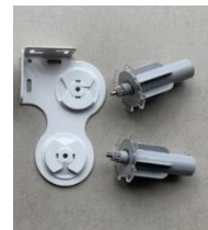
Idle End Plug to Idle End bracket