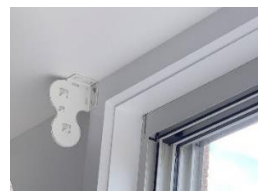
Fit Clutch bracket