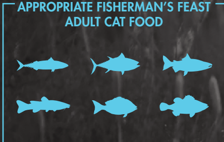
VETALOGICA BIOLOGICALLY APPROPRIATE FISHERMAN'S FEAST ADULT CAT FOOD