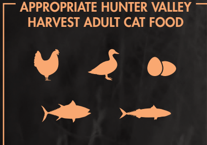
VETALOGICA BIOLOGICALLY APPROPRIATE HUNTER VALLEY HARVEST ADULT CAT FOOD