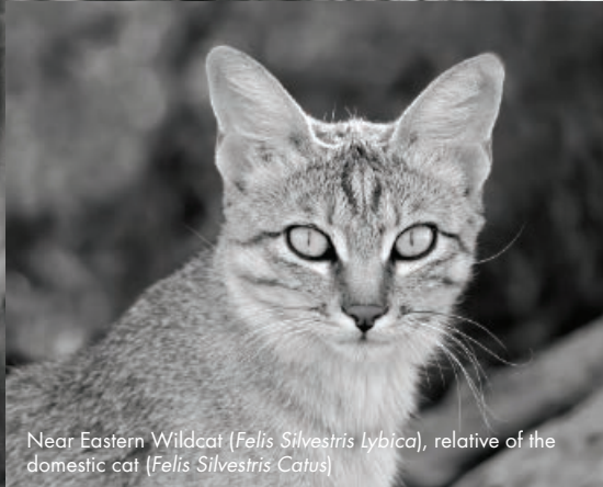
Near Eastern Wildcat ( Felis Silvestris Lybica ), relative of the domestic cat ( Felis Silvestris Catus )

The modern cats evolved from wildcats and the anatomies of modern cats and their ancestors are almost identical, meaning they need high meat diets. Cats crave quality meats and that's what we crafted in our biologically appropriate cat foods.