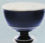
REGINA Earthenware with platinum trim. $995. ralphlaurenhome.com