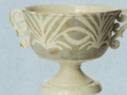
SAFARI LARGE PEDESTAL Handcrafted from Tuscan clay. $246. vietri.com