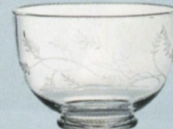
WISTERIA Engraved glass. $315. williamyeowardcrystal.com