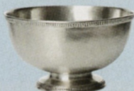
PEWTER BOWL Handmade in Italy. By Match. #A799.5. $965. ampersandshops.com