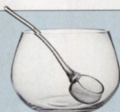
BOWL WITH LADLE Clear glass bowl with a smoke-gray glass ladle. $50. cb2.com