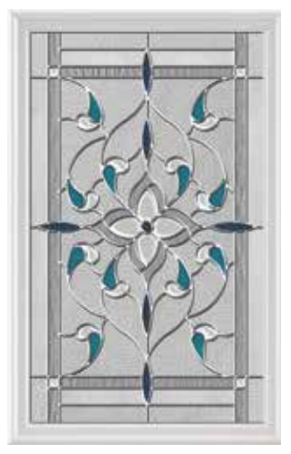
Storm Design Severe Weather Frame

ODL's patented frame design, which is mechanically fastened in the corners to prevent flex, adds strength to the door. With a classic frame profile the narrow aluminum extrusion adds strength while maintaining a pleasing shape. The natural contours provide a traditional architectural style, while the white powder coat surface provides a high gloss polished finish.