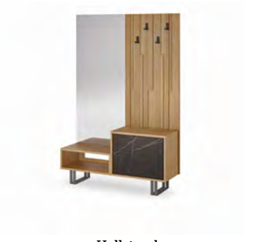
Hallstand ↔ 122 → 37,4 ↑ 180 cm EVE910

One door with ceramic and one mirror. One shelf behind the door. Four hooks. Iron feet.