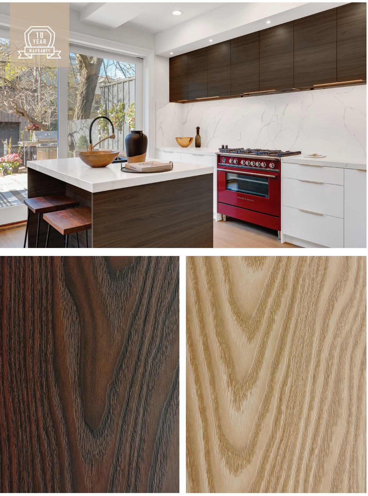
TS-MO-2412 Mystic Oak