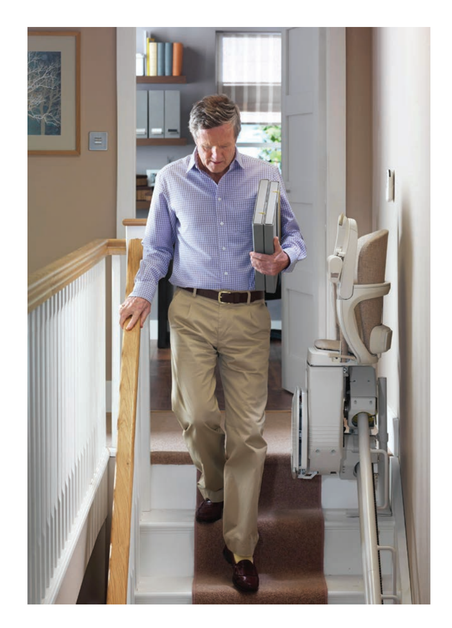
The Starla's slimline design allows others to still use the stairs

Tailor it to your tastes and home by choosing a fabric, with or without a light or dark wood finish or select the full vinyl upholstery in a range of sophisticated colours.