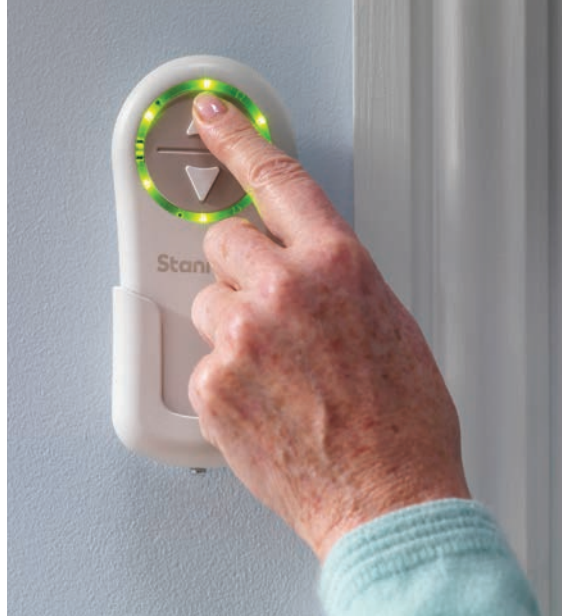
Use the wall control to call your Starla