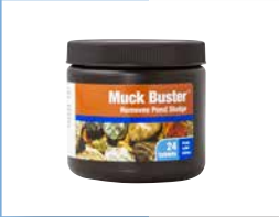
Muck Buster® #PB2682

If algae forms on columns, brush off and use CrystalClear® Algae D-Solv® #PB2002 to quickly clear organic debris and remove odors. 1 ounce treats 360 gallons.