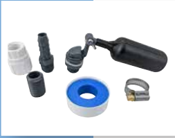
Auto Fill Kit #ABDAUTO

It is OK to run pump continuously 24/7, or you may choose to connect it to a timer and add a Lighting Kit #PB2897.