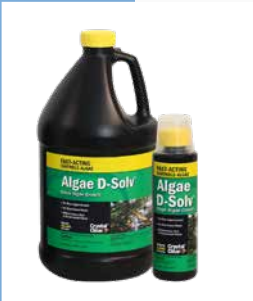
Algae D-Solv® #PB2002

If you need replacement parts please contact us directly at 888-619-3474 or email us at sales@bluethumbponds.com .