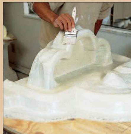
Latex is painted over the sculpture and let dry, creating a mold.