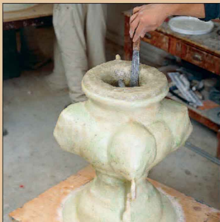
A fiberglass shell is created over the latex mold.