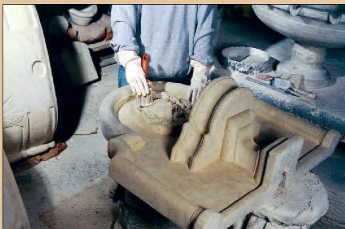
The piece is then sanded and prepared for finishing.