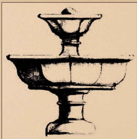
All Giannini Garden ornaments are original designs. We start with an idea, then make a detailed drawing.