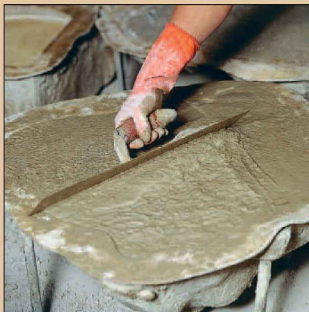
Concrete is hand-poured into mold.