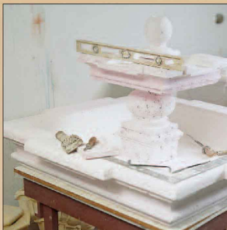
An original is sculpted from the drawing.