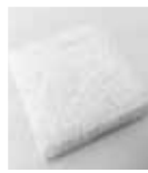
Acrylic-safe Algae Scrub Pad