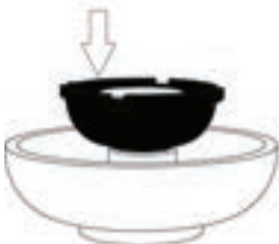
FT-306C (103 lbs) 29"W x 10.75"H

Step 5 - Place the pump cover (FT-306D) over the pump. Ensure it is centered and leveled.