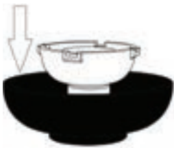
FT-306F (390 lbs) 48"W x 16.5"H

Step 1 - Position the basin (FT-306F) where the fountain is to be installed, ensuring that it is level.