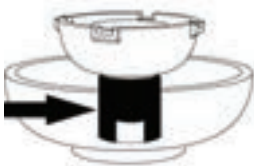
FT-306D (57 lbs) 12"W x 13"H

4a - Note: Using the handle of a screwdriver or hammer works best to press the stopper in place.