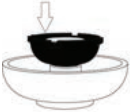
FT-306B (11 lbs) 11.5"W x 4.75"H

Step 10 - Place the disc stand (FT-306B) in the center of the small bowl (FT-306C).