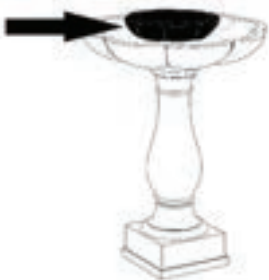
FT-170A (15 lbs) 13"W x 3"H