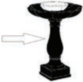
FT-180B (156 lbs) 26"W x 34.75"H