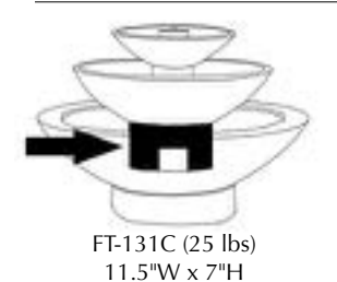
Step 6 - Place the pump house (FT-131C) over the pump and in the center of the Zen Bowl (P-502).