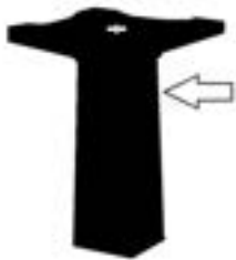
FT-107B (120 lbs) 18"L x 18"W x 25.5"H

Step 6 - Coil the pump cord in the pump house and push the pump down as far into the pump house as possible.