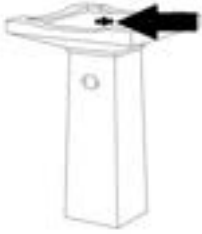
FT-107A (2.5 lbs) 5.75"L x 5.75"W x 1.5"H

Professional installation is recommended for this fountain!