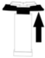
FT-378B (40 lbs) 30.5"L x 16.5"W x 6"H

Step 1 - Position the pedestal (PD-223) where the fountain is to be installed, ensuring that it will be level.