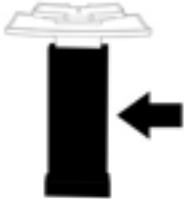
PD-223 (304 lbs) 14.5"L x 9.5"W x 33.25"H

Assemble your fountain on a level surface capable of holding a minimum of 370 lbs with an approximate 0.5 sq. ft. footprint (actual dimensions 14"L x 9.5"W).