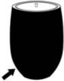
FT-363B (52 lbs) 12.25"W x 15"H

4a - Note: Using the handle of a screwdriver or hammer works best to press the stopper in place.