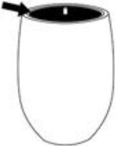
FT-363A (4 lbs) 9.25"W x 1"H

Step 8 - Evenly spread the pebbles on the top disc.