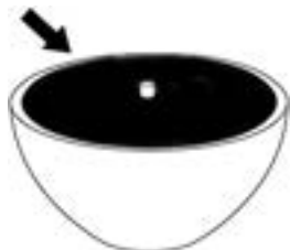
FT-359A (32 lbs) 20.25"W x 3.5"H

4a - Note: Using the handle of a screwdriver or hammer works best to press the stopper in place.