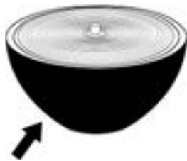
FT-360B (79 lbs) 23.25"W x 12"H

Step 1 - Position the basin (FT-360B) where the fountain is to be installed, ensuring that it is level.