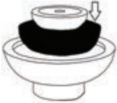
FT-34B (82 lbs) 22.25"W x 6"H

Step 7 - Center the middle bowl (FT-34B) over the pump house (FT-34C).