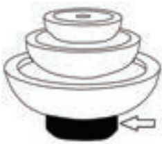
FT-34E (28 lbs) 14"W x 4"H

Assemble your fountain on a level surface capable of holding a minimum of 394 lbs with an approximate 1 sq. ft. footprint (actual dimensions 14" diam.).