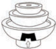
FT-34CC (1 lbs) 5"L x 2"W x 3.5"H

Step 10 - Fit the pipe protruding from the top of the middle bowl (FT-34B) into the hole in the bottom of the small bowl (FT-34A).