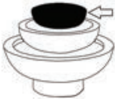
FT-34A (34 lbs) 15.25"W x 4.5"H

Step 8 - Use a hose clamp to secure the other end of the non-kink tubing to the pipe protruding from the bottom of the middle bowl (FT-34B).