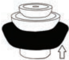
FT-34D (165 lbs) 30"W x 7.75"H