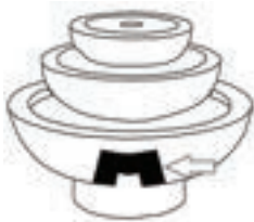
FT-34C (16 lbs) 11"W x 5"H

5a - Note: Using the handle of a screwdriver or hammer works best.