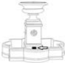
FT-29BB/30CC (4 lbs) 5"L x 1"W x 5"H

Step 12 - Fit the Spout Assembly over the centered pipe inside the urn.