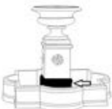
FT-29B/30C (52 lbs) 12"L x 12"W x 8"H

Step 5 - Place the pump cover (FT-29B/30C) over the pump. Ensure it is placed properly and leveled.