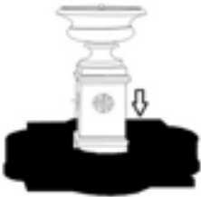
FT-29C/30D (579 lbs) 45"L x 045"W x 011"H

Step 4 - Use a GFCI Outlet: Use only a GFCI outlet when running a fountain.