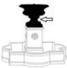
FT-30A (134 lbs) 18"L x 18"W x 21"H

Step 10 - Center the urn (FT-30A) over the column (FT-30B).