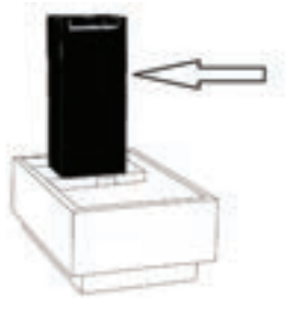
FT-287A (134 lbs) 10"L x 7.5"W x 25"H