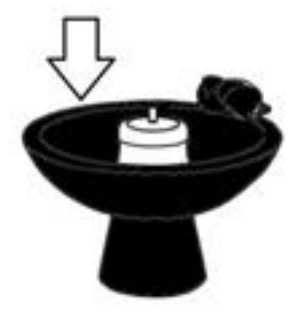
FT-255B (59 lbs) 22.25"W x 15.5"H