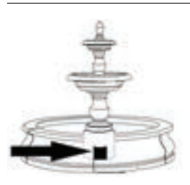
FT-193G (6 lbs) 7.5"L x 2.75"W x 5.5"H

Step 17 - Fit the pump cover door (FT-193G) into the pump cover (FT-193F).