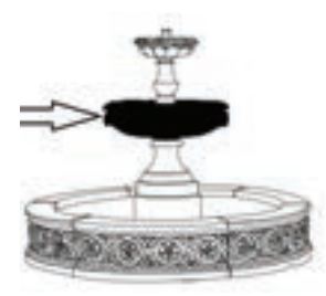
FT-184D (254 lbs) 36"W x 10.5"H