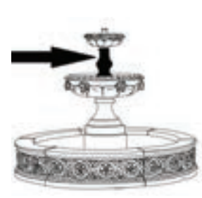
FT-184C (53 lbs) 9.25"W x 20"H

Step 15 - Feed the loose end of the non-kink tubing through the center hole of the small pedestal (FT-184C) as you lower it into position.