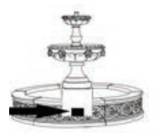
FT-184G (7 lbs) 10"L x 4.25"W x 5.25"H