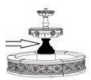
FT-184F (162 lbs) 18.25"W x 16.25"H

Step 9 - Place the large pedestal (FT-184E) on top of the pump house (FT-184F).