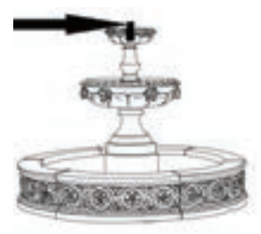
FT-184A (5 lbs) 4.75"W x 7"H

Step 18 - Place the finial (FT-184A) in the small bowl by lowering the hole over the copper pipe protruding from the bowl.