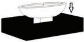
FT-103D (264 lbs) 43"L x 26"W x 8"H

Step 1 - Position the basin (FT-103D) where the fountain is to be installed, ensuring that it is level.