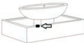
FT-103C (1 lbs) 3.5"L x 1"W x 4"H

Step 9 - Insert the 6 3 / 4 " length of copper pipe into the CPVC coupling inside the water feature (FT-103A).