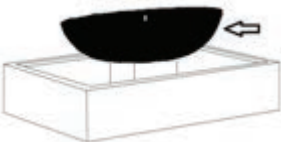
FT-103A (96 lbs) 34.75"L x 18.5"W x 8"H

Step 5 - Place the pump cover (FT-103B) over the pump. Ensure it is placed properly and leveled.