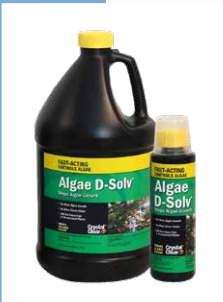
Algae D-Solv® #PB2002

If you need replacement parts please contact us directly at 888-619-3474 or email us at sales@bluethumbponds.com .