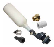
Auto Fill Kit #ABDAUTO