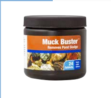
Muck Buster® #PB2682