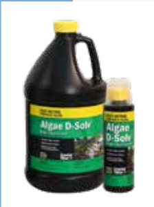
Algae D-Solv® #PB2002