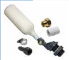
Auto Fill Kit #ABDAUTO