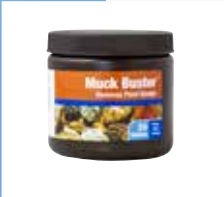
Muck Buster® #PB2682