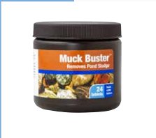
Muck Buster® #PB2682