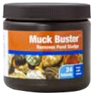
Muck Buster® #PB2682

DO NOT DRAIN THE BASIN FOR THE WINTER. It is best to keep the basin at least 50% filled with water to avoid heaving during freeze and thaw. Drain and refill in spring during your seasonal cleaning.