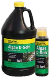
Algae D-Solv® #PB2002

If you need replacement parts please contact us directly at 888-619-3474 or email us at sales@bluethumbponds.com .