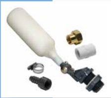
Auto Fill Kit #ABDAUTO

If algae forms on columns, brush off and use CrystalClear® Algae D-Solv® #PB2002 to quickly clear organic debris and remove odors. 1 ounce treats 360 gallons.