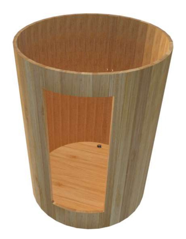
17. Carefully unwrap the aluminum shower bands. Bring the ends of the band together and connect with the threaded rod and nuts. Hand tighten only.

15. Fit the short top stave assembly in between the left and right door sides.