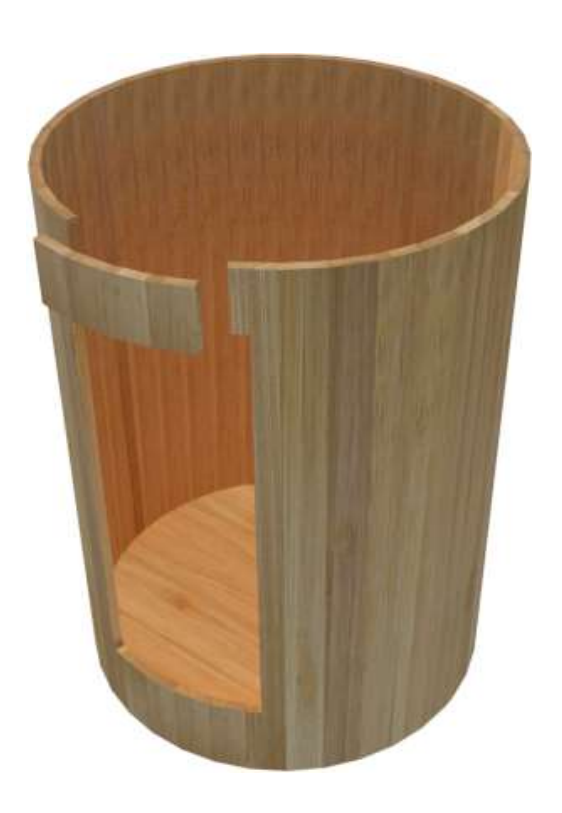
16. Secure with provided screws.

Slide one of the aluminum bands over the top of the shower.