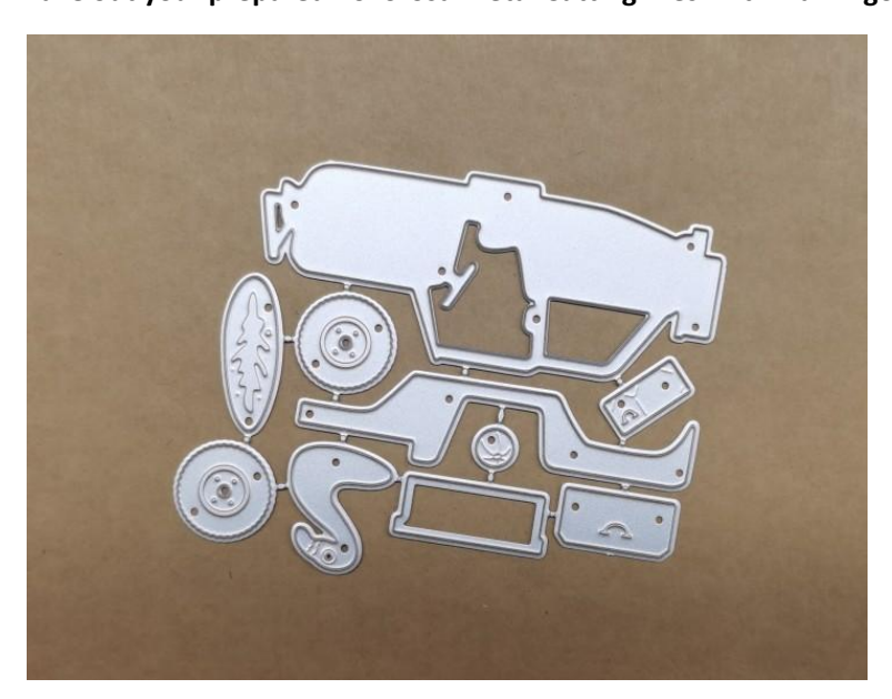
Step 1: Cutting out the shapes of Flamingo & Jeep with a cutting machine