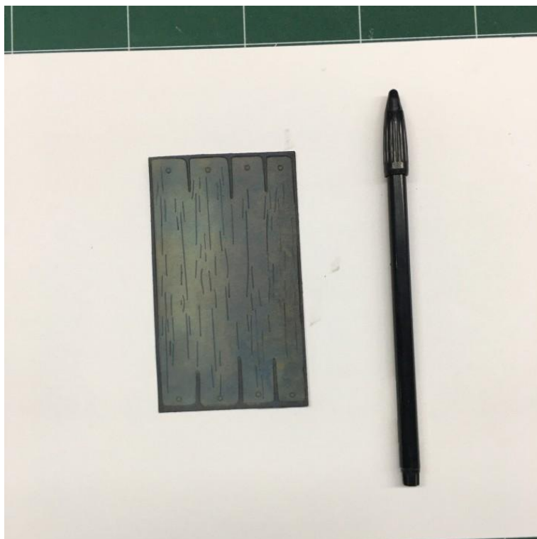
Step 3: Paste the Accessories on the Wooden Door