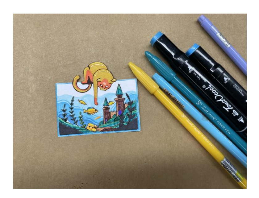
Step 3: Glue the finished cutting dies to the prepared background paper