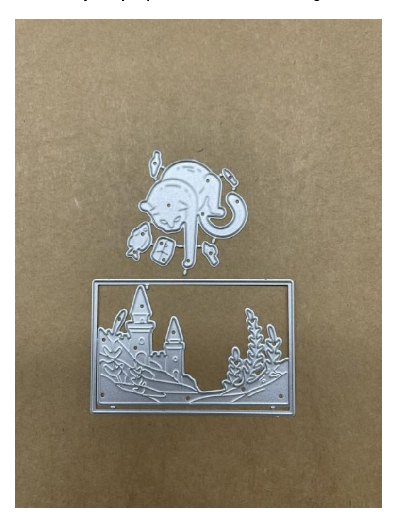
Step 1: Cutting out the shapes of this cutting die with a cutting machine