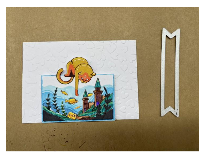
Step 4: Put a tag on it