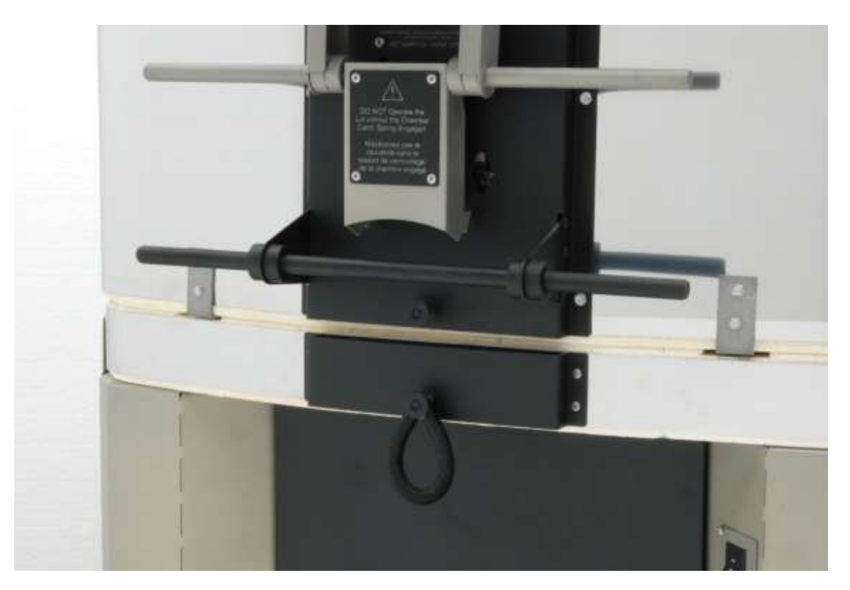
Figure 2 - Chamber Safety Catch Unsecured

To operate the chamber: verify that the lid is closed, and the Chamber Safety Catch spring is not secured to the chamber as shown (Fig. 2). Grasp the chamber handle with both hands and raise the chamber back until it automatically stops. As it stops, the Chamber Safety Bar notch will drop into the wire form catch located on the base. The chamber will now stay in the fully open position. To lower the chamber, grasp the chamber handle with your right hand and the chamber safety bar with your left hand. Pull the chamber safety bar towards you. Begin to lower the lid until the notch in the chamber safety bar clears the wire form catch. Once it does, remove your left hand from the chamber safety bar and grasp the chamber handle with both hands. You are now able to gently lower the chamber to the closed position.