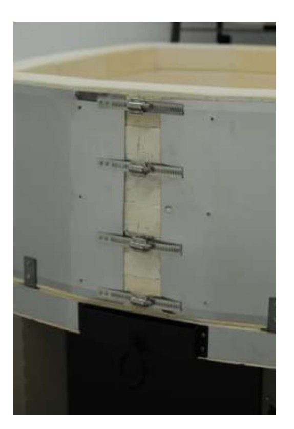
Figure 4 - Expose Jacket Clamps