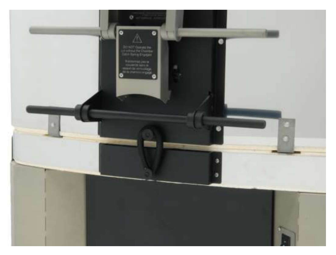
Figure 1 - Chamber Safety Catch Engaged

Note that before you operate the lid, the chamber must always be closed, and the chamber safety catch spring must be secured to the chamber (as shown above). This prevents accidental movement of the chamber while operating the lid.