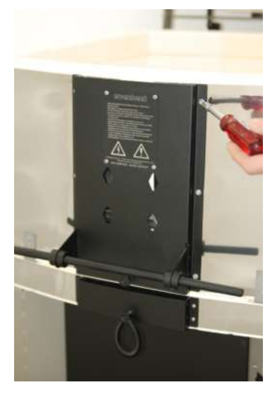
Figure 3 - Remove Chamber Handle Assembly

Studio Pro 24 / Studio Pro 28 / Studio Pro 41 Installation, Operation and Maintenance Manual Original Instructions Dec. 2023