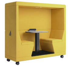
YO-YOPOD® 2-Seater / FULLBACK