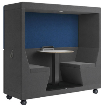
YO-YOPOD® 2-Seater / FULLBACK