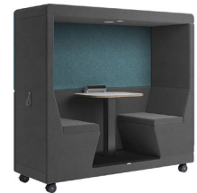
YO-YOPOD® 2-Seater / FULLBACK