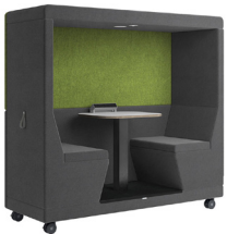
YO-YOPOD® 2-Seater / FULLBACK