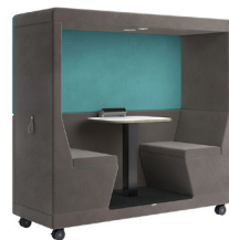
YO-YOPOD® 2-Seater / FULLBACK