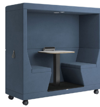
YO-YOPOD® 2-Seater / FULLBACK