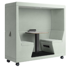
YO-YOPOD® 2-Seater / FULLBACK