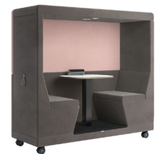
YO-YOPOD® 2-Seater / FULLBACK