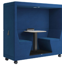
YO-YOPOD® 2-Seater / FULLBACK