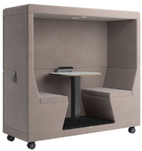
YO-YOPOD® 2-Seater / FULLBACK