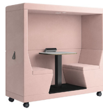
YO-YOPOD® 2-Seater / FULLBACK