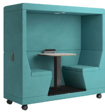
YO-YOPOD® 2-Seater / FULLBACK