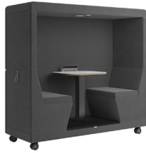
YO-YOPOD® 2-Seater / FULLBACK