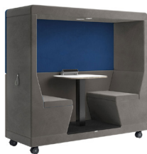
YO-YOPOD® 2-Seater / FULLBACK