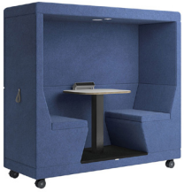
YO-YOPOD® 2-Seater / FULLBACK