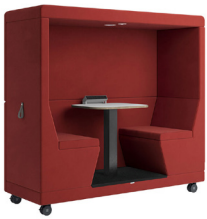
YO-YOPOD® 2-Seater / FULLBACK