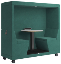
YO-YOPOD® 2-Seater / FULLBACK