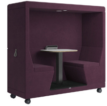
YO-YOPOD® 2-Seater / FULLBACK