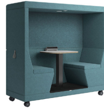
YO-YOPOD® 2-Seater / FULLBACK