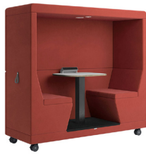
YO-YOPOD® 2-Seater / FULLBACK