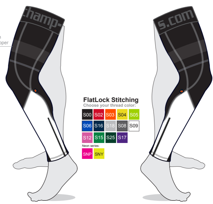
: Left Leg View : : Right Leg View : : PERFORMANCE Leg Warmer / TECH Leg Cooler : (LWL025 / LWL023)